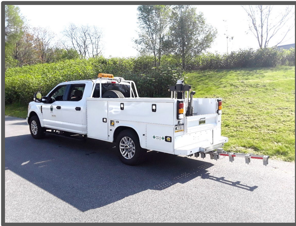
Dynatest Truck Mounted Deflectometer (TMD)

The Department has been performing FWD testing since 1985. RITU currently owns two Falling Weight Deflectometer devices, both are manufactured by Dynatest.