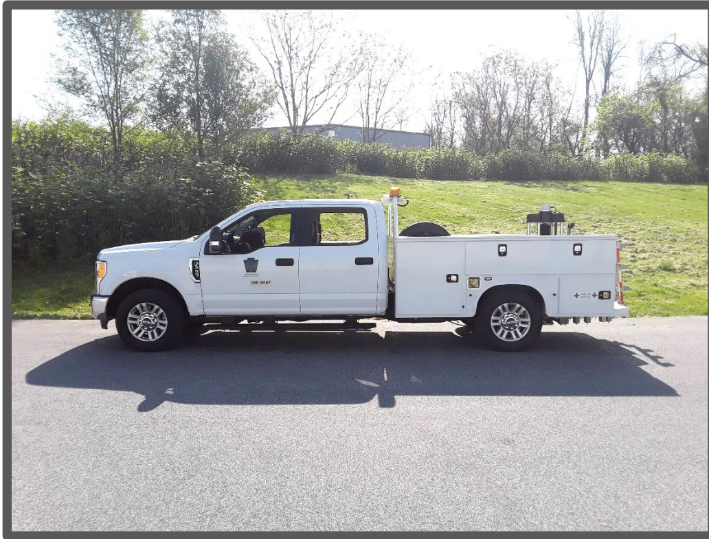
PennDOT's Falling Weight Deflectometer

RITU performs Falling Weight Deflectometer (FWD) testing for the investigation of pavement structural capacity, performance, postings, and other special circumstances, typically as requested by District offices.