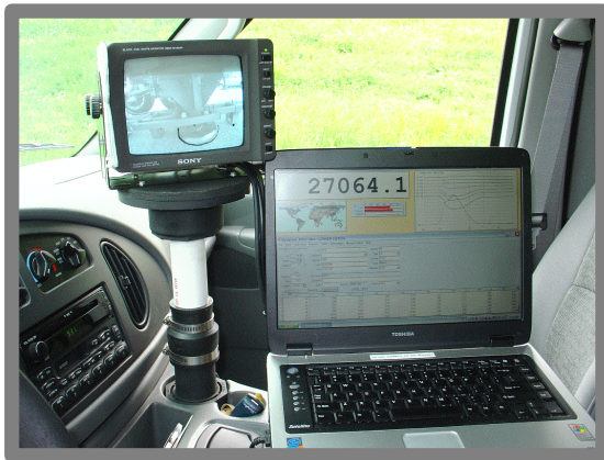
Control PC and Camera Monitor

An FWD is a device that drops weight, of amounts controlled by the operator, onto a load plate positioned on the pavement surface (usually in the right wheelpath) and measures the deflection of the pavement with seven sensors. These sensors are spaced one foot apart in a series along the device with one sensor located directly over the point of loading. Deflection is measured in "mils," which are thousandths of an inch. The van that tows the test device is equipped with computer system electronics to control the testing and record the measurements. The deflection basin can be determined from these measurements.