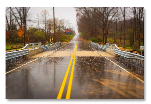
Bridge JV-577, Jonestown Road (RT 4013) over Tributary to Raccoon Creek, Lebanon County