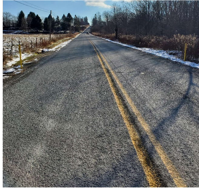
LOOKING AHEAD – EAST