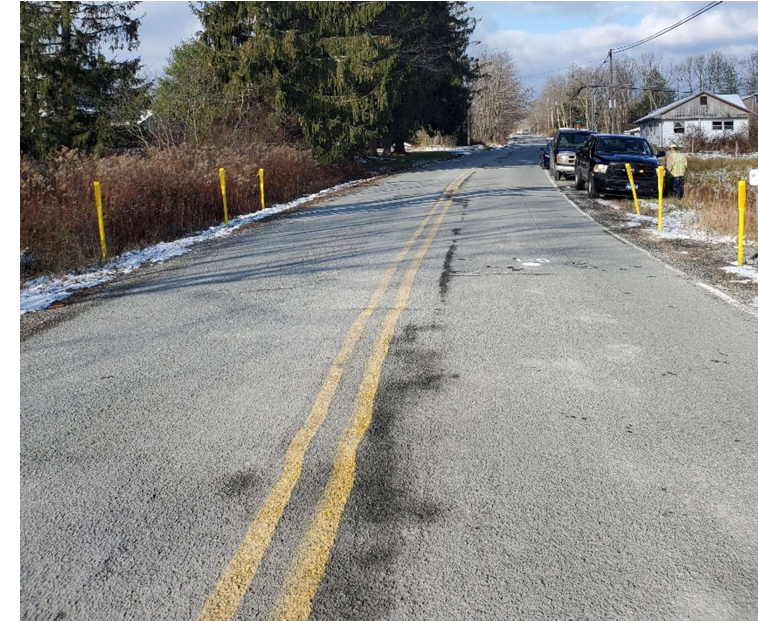
LOOKING BACK - WEST