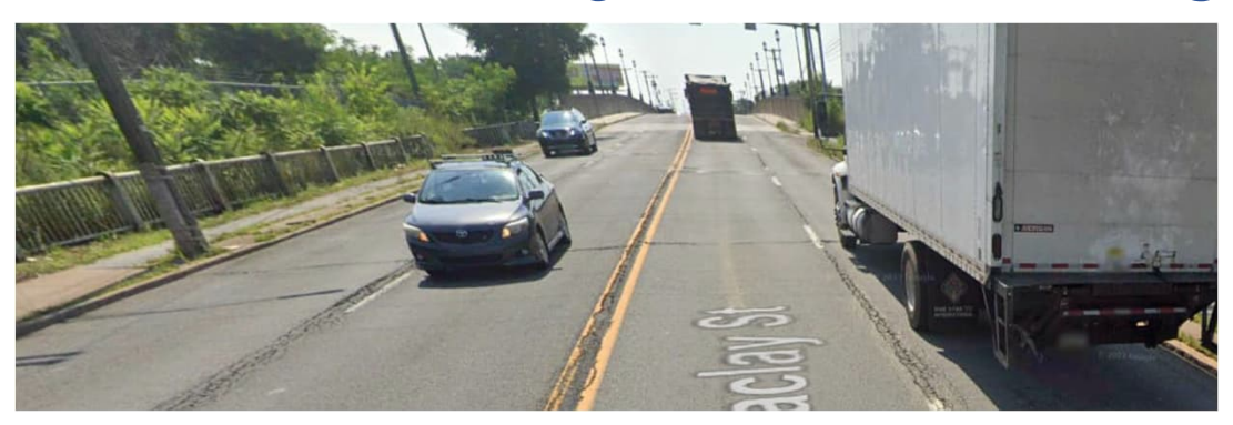
Existing 4-Lane Roadway