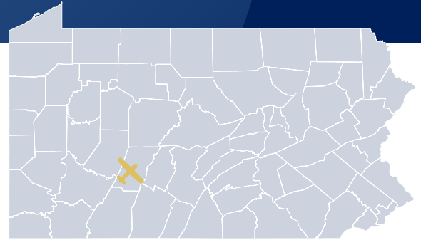
This airport is classified as a Basic Airport in Pennsylvania's State Aviation System Plan and is eligible to receive federal funding from the FAA.

Ebensburg Airport (9G8) is a general aviation airport located approximately three miles southwest of Ebensburg and roughly 50 miles north of the Maryland border. The airport primarily serves as a facility for private flight training and military helicopter training. The airport also supports aerial inspections, police and law enforcement activity, and medical transportation. The airport has a turf runway, which provides a unique landing experience for lighter aircraft and other recreational flights. The airport serves a critical role in the local medical community by supporting emergency medical air transportation. The airport works to maintain its relationship with the local community by hosting community events and car shows, which bring in members of the local area and visitors from the central Pennsylvania region.