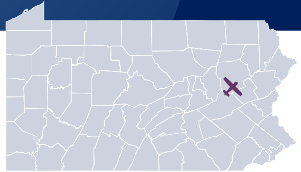
This airport is classified as a Advanced Airport in Pennsylvania's State Aviation System Plan and is eligible to receive federal funding from the FAA.

Hazleton Regional Airport (HZL) is a general aviation airport located in Hazleton, about 50 miles north of Allentown. Airport staff pride themselves on having over 30 years of experience in the aviation business. The airport provides full-service fixed-base operator (FBO) services and services all corporate aircraft. The airport welcomes aircraft with multiple tie-down locations, overnight and monthly hangar lease space, aircraft fuel, and tug services for single engine and jet aircraft. Aircraft maintenance and avionics is also provided on-site, as well as mobile aircraft detailing services. The airport plays a key role in health and safety services throughout the Lehigh and Susquehanna North Branch Valleys; LVHN MedEvac is based at the airport and provides critical life flight services and medial transport daily. Recreationally, the airport hosts the Collings Foundation Static Airshow, and business tenant NEPA Ripcords offers premier skydiving trips over the mountains of northeast PA.