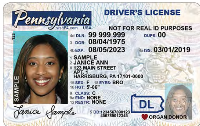
Standard-Issue (Non-Compliant) Photo ID Card