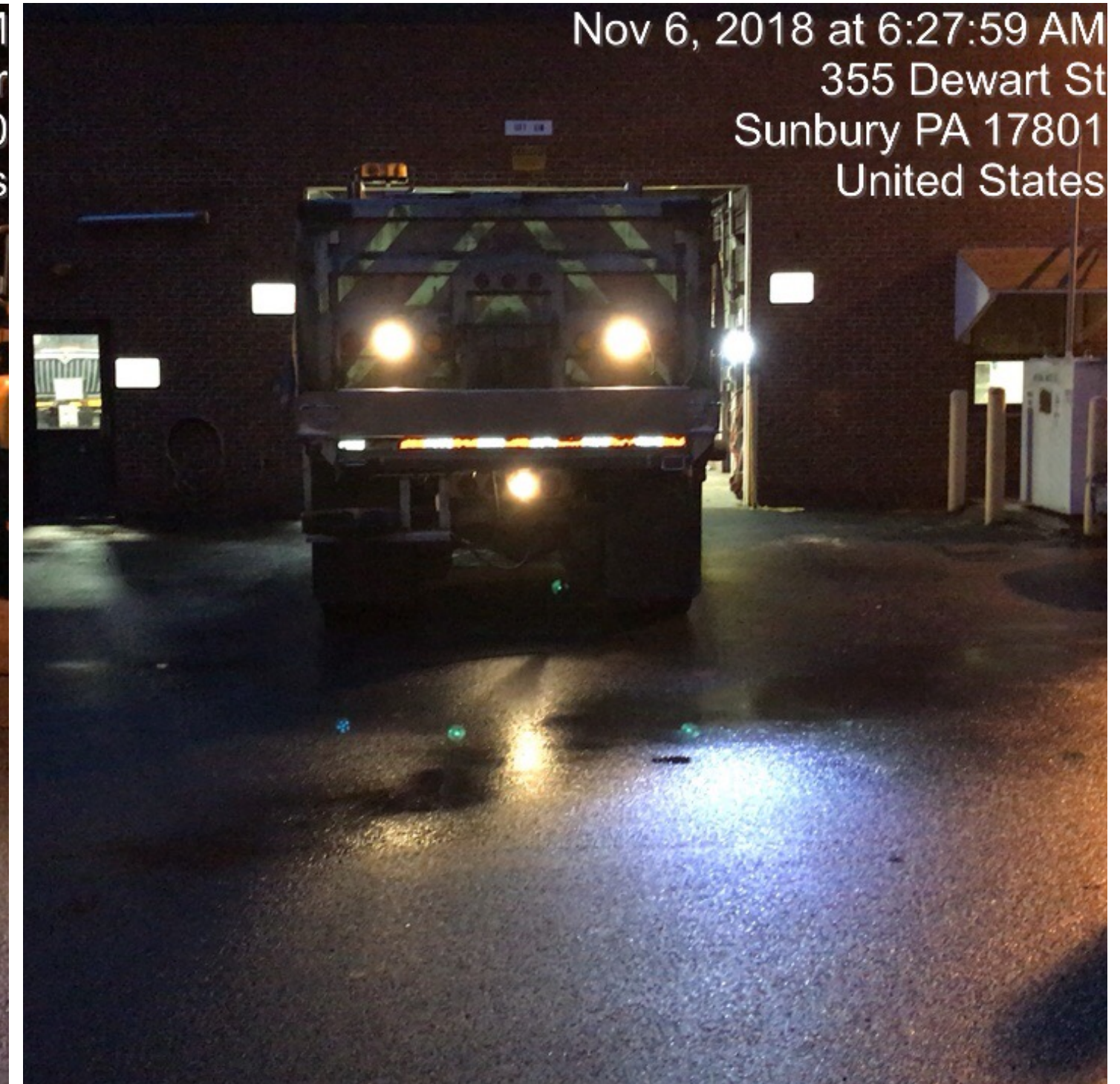
Light Turned On