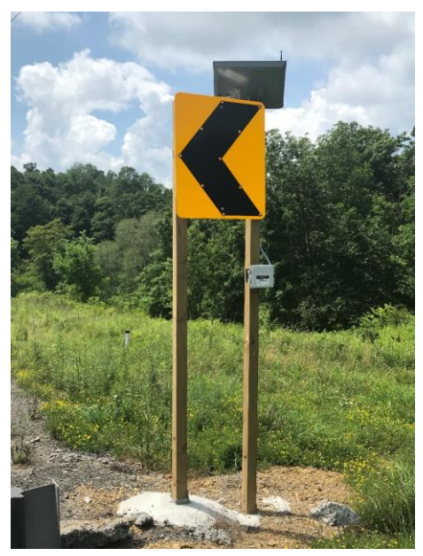
All of District 11's ground installations currently utilize wooden poles set in concrete as shown. In the future, staff will consider metal cast bases instead to simplify replacement.

For both electrically and solar powered chevron installations, materials chosen for the project may ultimately depend on lead times for procurement.