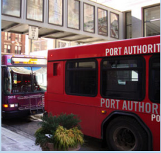
Mobility & Efficiency