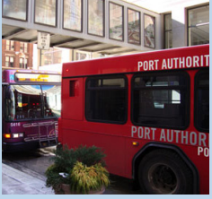
Mobility & Efficiency